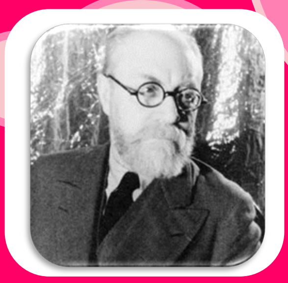
Using a similar style to this artist, create your own artwork in your sketchbook.

Find a picture of another piece done by this artist and glue in the space.