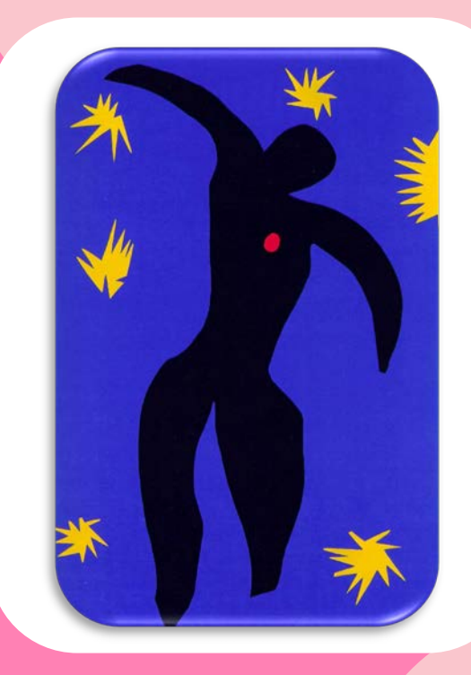
lcarus, plate VIII from the illustrated book, "Jazz"

Commencement date: Monday 26 January Due Date: Monday 9 February